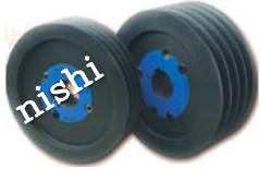
TAPPER LOCK PULLEYS