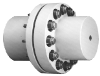
PIN BUSH COUPLINGS