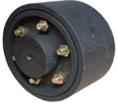
BRAKE DRUM COUPL