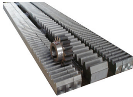
ALL TYPES OF RACKS & PINIONS